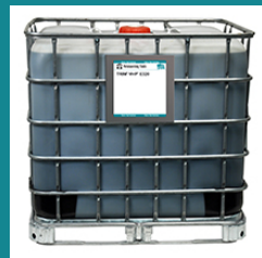
270-gallon tote SKU: VHPE320/NR270P UPC-12: 641238033844

TRIM ® VHP ® E320 | ©1993-2021 Master Fluid Solutions ® | 2021-12-27