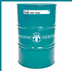
54-gallon drum SKU: VHPE320/54 UPC-12: 641238012252