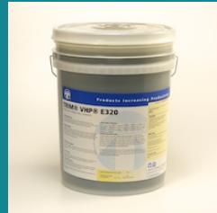
5-gallon pail SKU: VHPE320/5 UPC-12: 641238012245