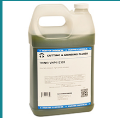
1-gallon jug SKU: VHPE320/1 UPC-12: 641238022350